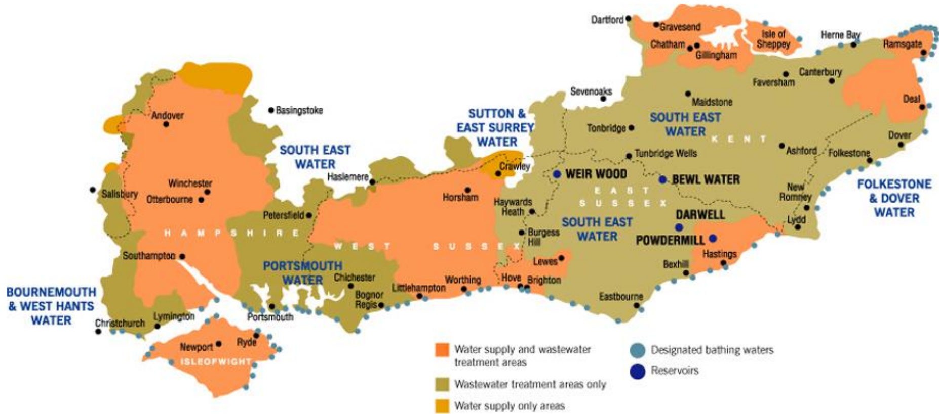
Figure B – Southern Water’s Supply Area