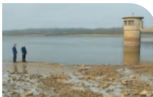
Weir Wood Reservoir in February 2005

We recently completed a study on the effects on the River Itchen in Hampshire, a site that was designated as a candidate Special Area of Conservation for its European nature conservation importance. This year we have continued to work with our stakeholders to develop a sustainable management strategy for the river.