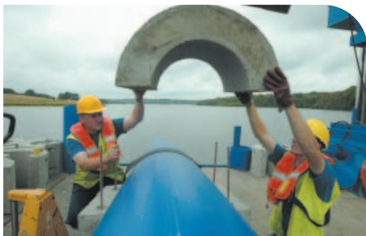
Construction of the Bewl-Darwell transfer pipeline

Our region's existing water resources are used to their full capacity. Major new water resource developments are required to maintain future levels of service